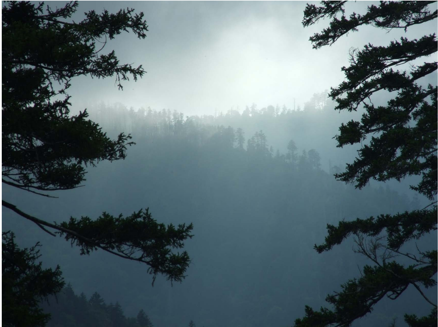
Great Smoky Mountains National Park