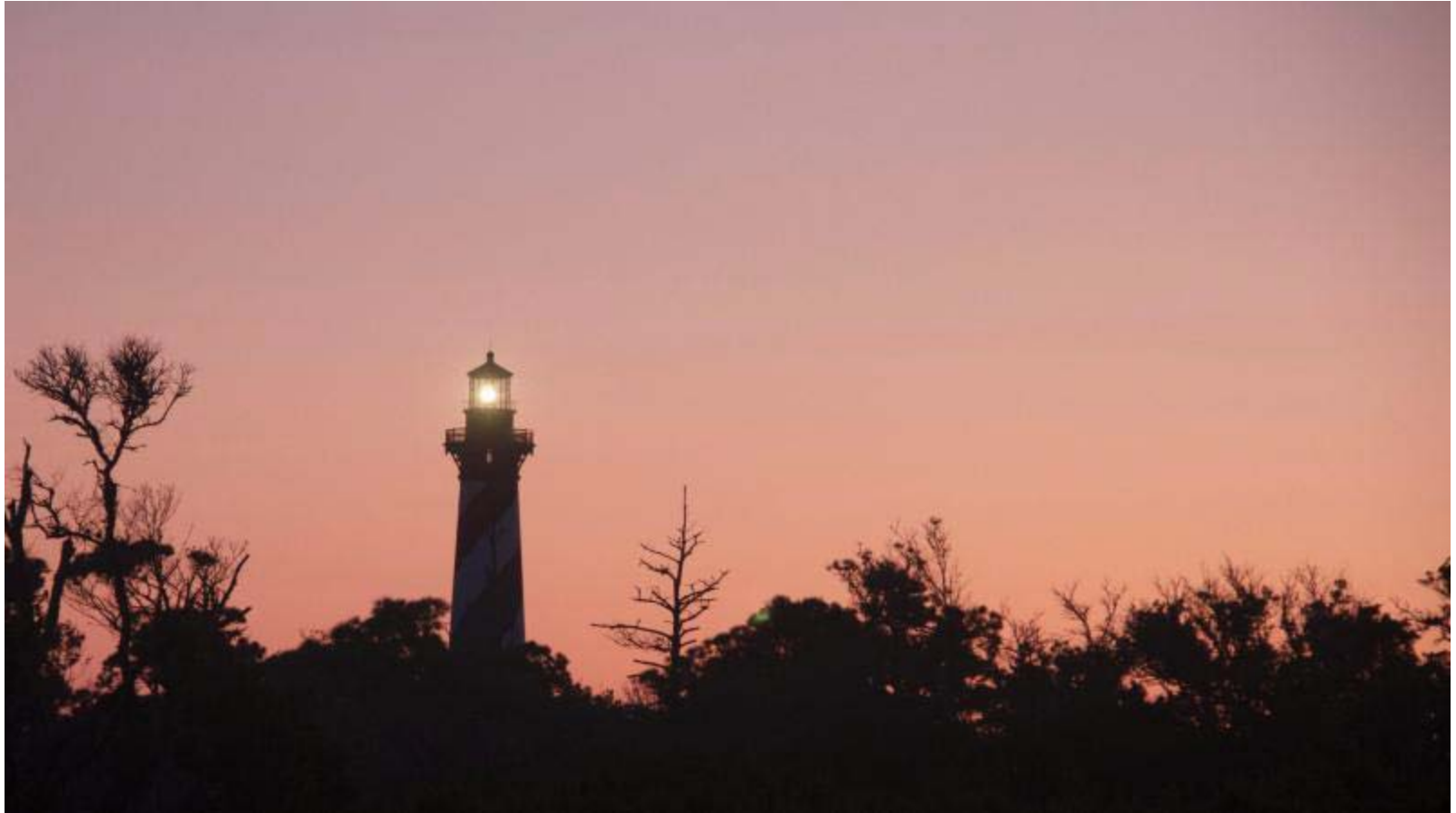
Cape Hatteras National Seashore