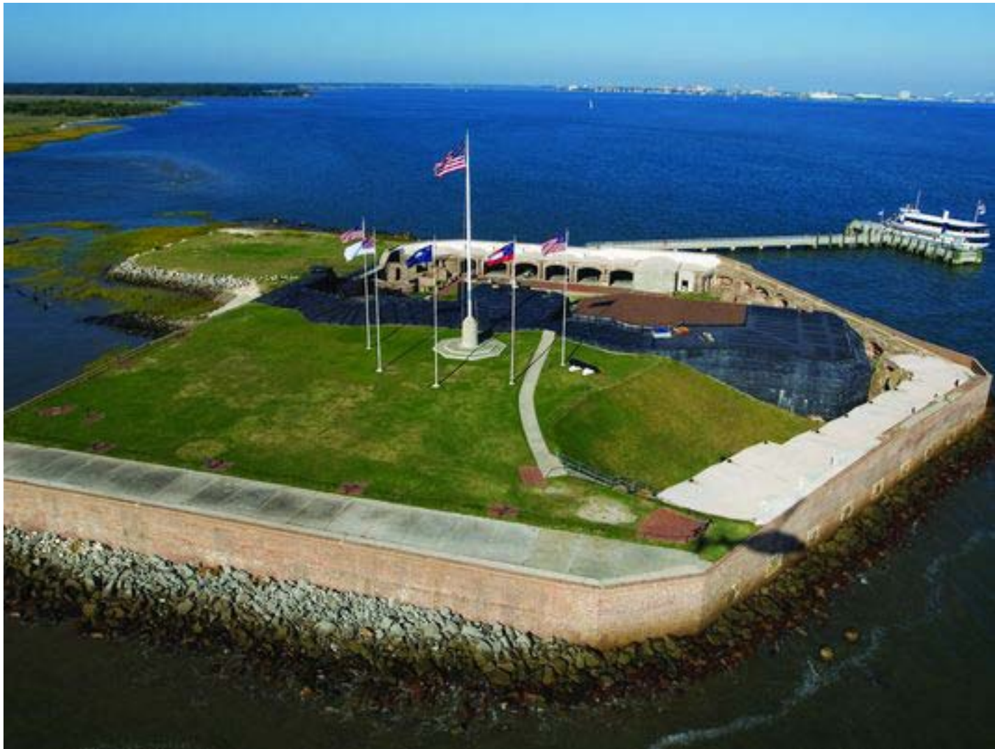
Fort Sumter National Monument